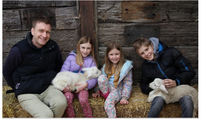
Families enjoying the Lambing and Animals Weekend

enjoying holding the new born lambs, meeting our 500 ewes and exploring our beautiful 650-acre farm."