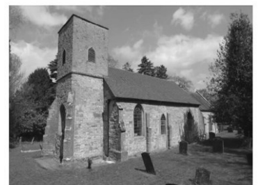
Welcome to Moreton Morrell Parish