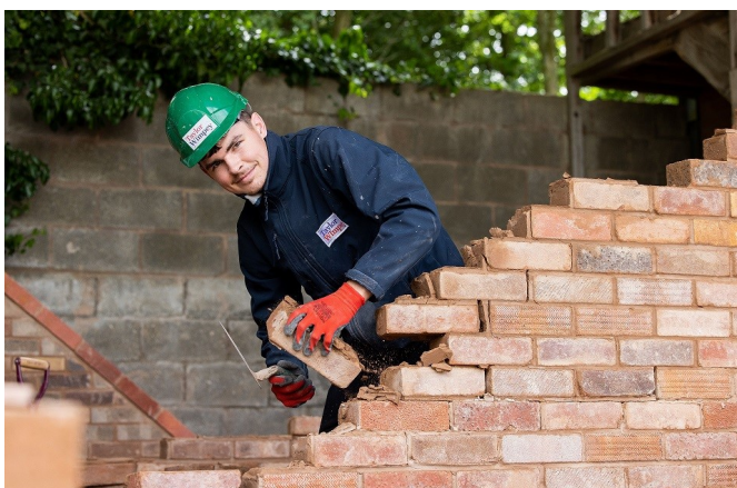
One of the learners in the facility

“Congratulations to all of our graduating apprentices this year and we wish them all the best as they move forward in their careers.”