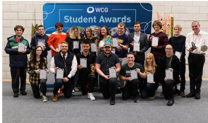
Award-winning students at Moreton Morrell College

the vast array of awards presented on the evening.”