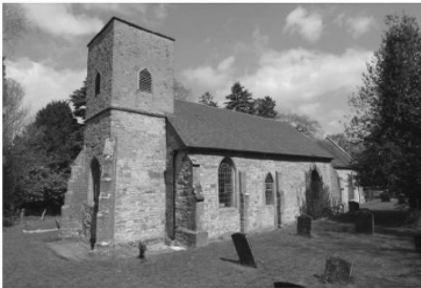
Welcome to Moreton Morrell Parish