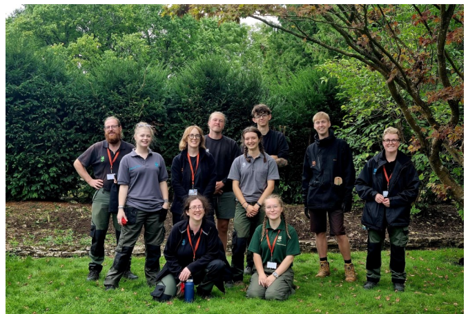
Apprentices starting work on the gardens at Moreton Hall

"This is a very exciting project and we will be sharing updates throughout as we restore the beautiful gardens at Moreton Hall to their former glory."