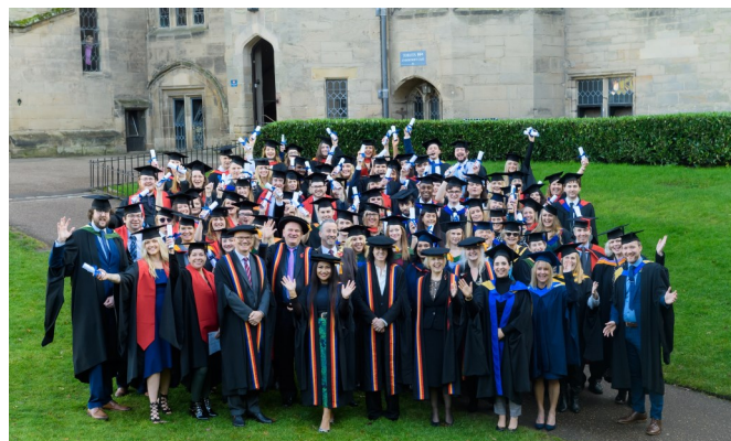
Students from Moreton Morrell College celebrating graduation at Warwick Castle

throughout the course. Although it was a big transition academically working with scientific writing and journals, my tutors have always been on-hand to support my learning."