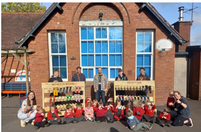
Carpentry students with the new welly racks

"The apprentices completed the project to a high standard and we are delighted to hear how useful the new welly racks have been for the children."