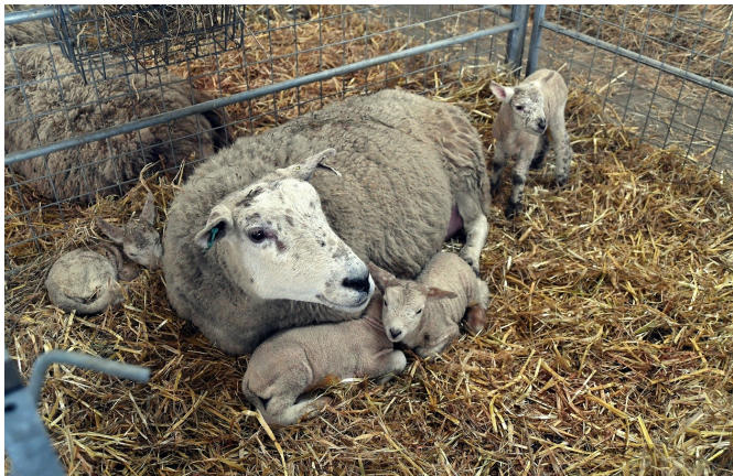
Lambing at Moreton Morrell College

(two adults and two children), £6 for adults and £3 for children. Under 2s go free.