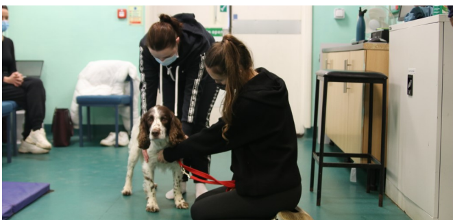
Students at Moreton Morrell College

“Both courses will be subject to annual monitoring by the AHPR and as a college we will continue to invest time and resource to ensure our courses are hitting and surpassing benchmarks set by the accrediting body.”