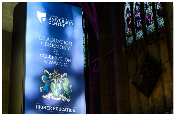
Warwickshire College and University Centre (WCUC)

“As part of launching the new centre, we have been working across each college to enhance our offer and facilities to meet the relevant industry and sector standards.”