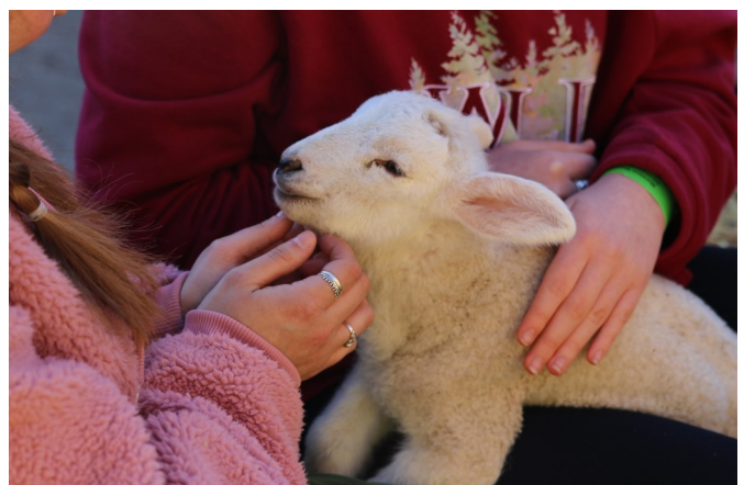
A new-born lamb at last year's event

Advanced tickets are priced at £18 for a family ticket (two adults and two children). Tickets on the day are priced at £7 for adults, £4 for under 16s and £5 for OAPs. Children aged under two can enter free of charge. For more information and to book advanced tickets visit www.wcg.ac.uk/lambing