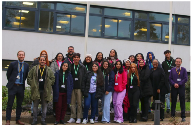
Brazilian students arrive in Warwickshire as part of the Connect the World programme

programme is funded by the government of Paraiba and aims to encourage the internationalisation of the states and the growth of its prosperity through international exchange initiatives for students and staff from state schools.