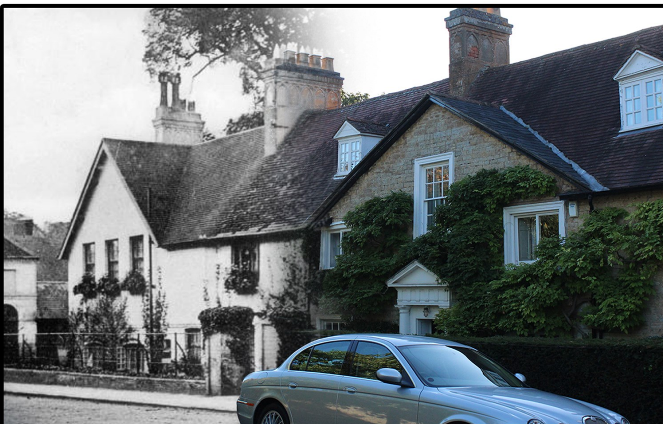
Moreton House - Then and Now