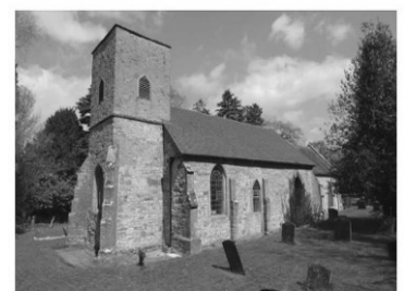
Welcome to Moreton Morrell Parish