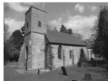
Welcome to Moreton Morrell Parish