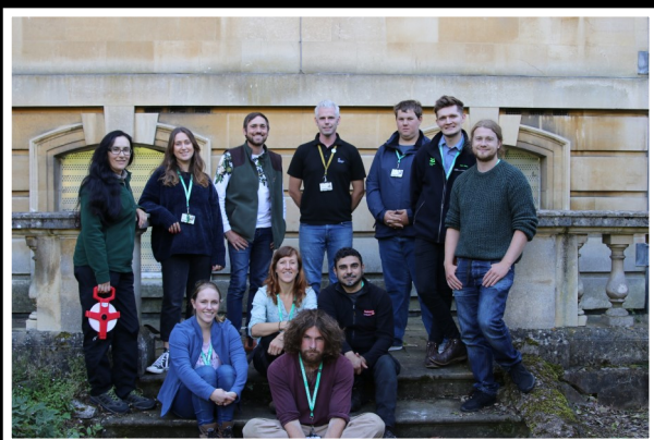
Tutors and students on site at Moreton Hall.