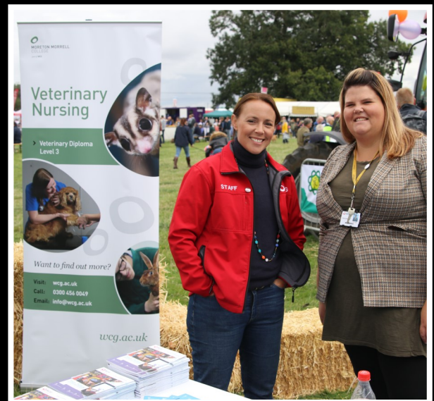
Moreton Morrell College staff at the Moreton-in-Marsh show

Tutors from the college put on displays about animal nursing, science and biology – while also hosting a display of a range of animals and insects, offering youngsters the chance to learn more about each species.