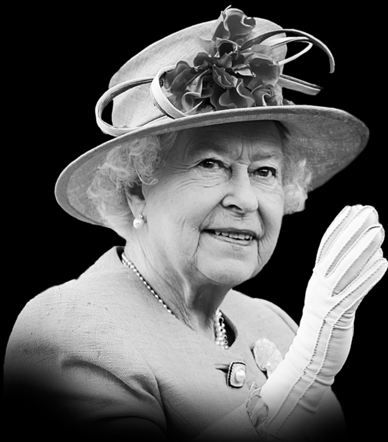
Her Majesty Queen Elizabeth II 1926 — 2022