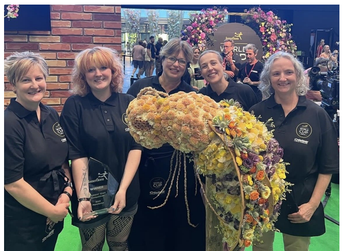
The winning team from Moreton Morrell College with their first place floral design